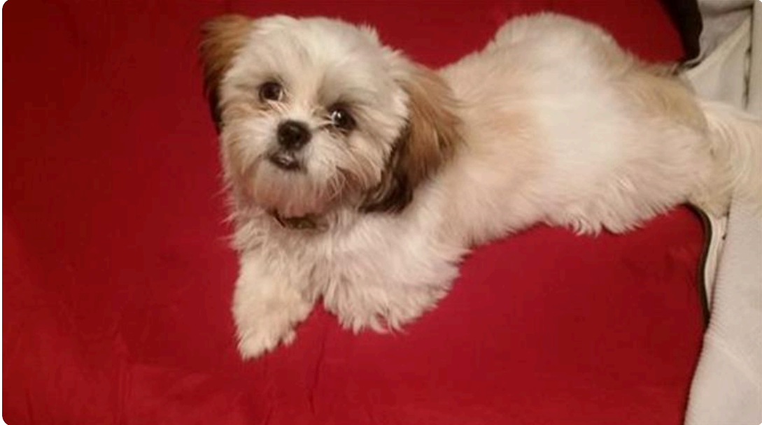
Coco groomed By Catherine